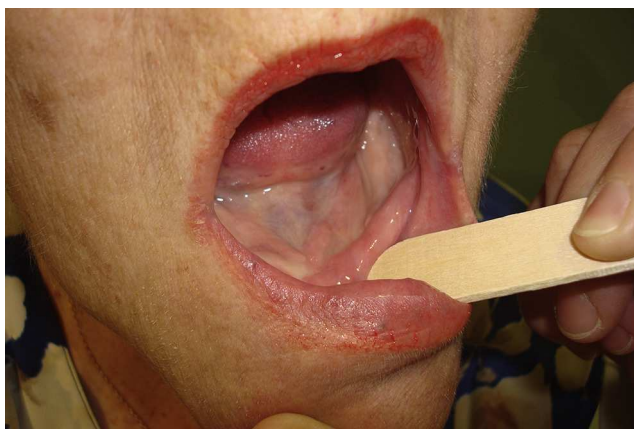
Figure 2 Flap result in the patient shown in Fig. 1, at 5 months postoperative.

suture over the bone defect, with reappearance of the fistula. Lastly, a distal branch of the buccal branch of the facial nerve was injured in 1 patient during a particularly difficult dissection. This patient presented buccal corner asymmetry that did not improve over time.