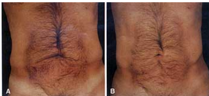
Fig. 3. A 50-year-old male patient. (A) Preoperative appearance. (B) Postoperative view after 4 months.